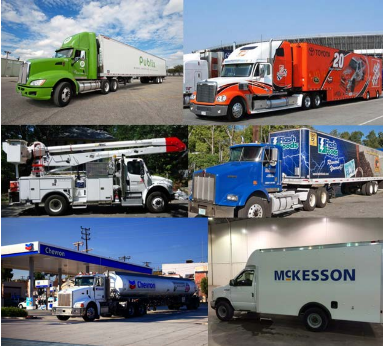
Figure 2: Examples of what constitutes a marked vehicle.

Personnel entering impacted areas during Phase 3 in marked (see Figure 2), unmarked, or civilian vehicles should be prepared to present an Official State of Georgia Re-Entry Permit, employee credentials, and a valid state-issued photo identification card to public safety personnel controlling access. Individuals working as contractors or subcontractors for an organization or business approved for Phase 3 re-entry are also required to have an employer authorization letter. All personnel and equipment entering an impacted area during Phase 3 and beyond must maintain self-sustaining capabilities.